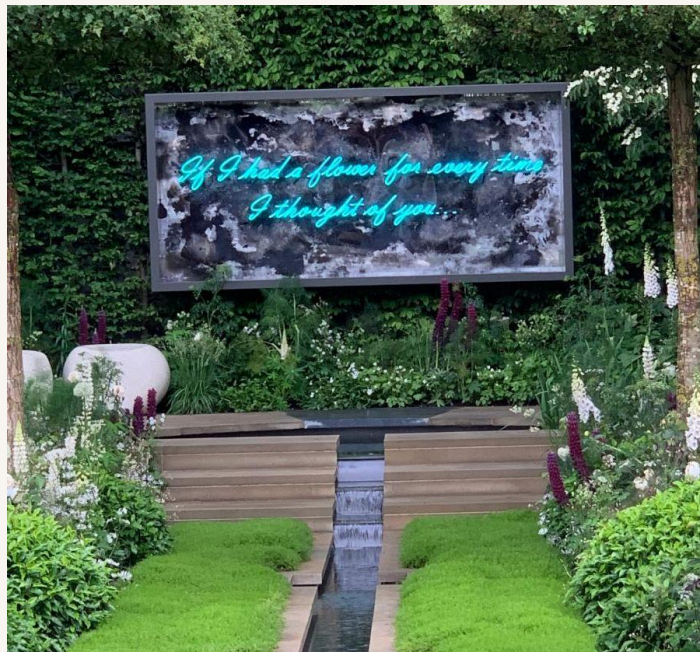
Chelsea Flower Show 2022